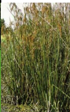
Baumea articulata