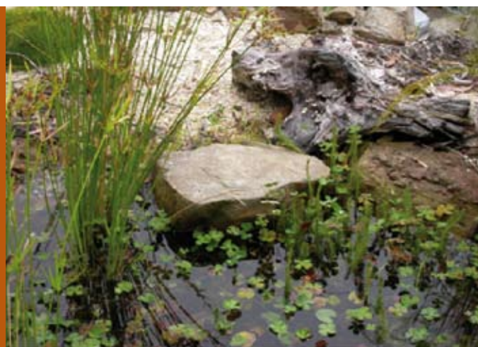
Rocks, logs and vegetation provide important hiding places for frogs.

For specific details, refer to the ACT Planning and Land Authority website. Go to the Table of Exempt Works, section 9: an outdoor ornamental pond. www.actpla.gov.au/bepcon/build/exemptwork.pdf