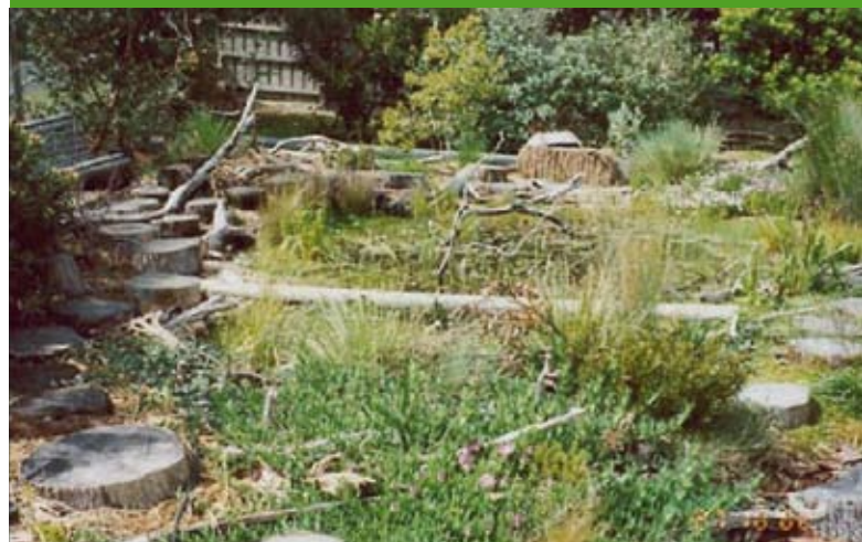
The Victoria Frog Watch Frog Friendly Garden of the Year, 2002.

Creating or maintaining a frog friendly habitat in our backyards or schoolyard is one way that we can help to protect local frog populations and maintain the health of our natural environment.