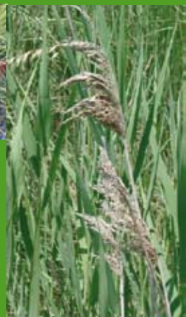
Phragmites australis