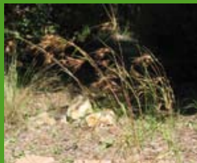
Themeda triandra