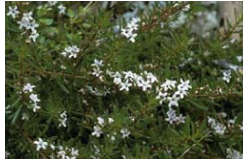
Myoporum parvifolium

As with all garden plantings, make sure none of the species you are planting are registered weeds. A chart of local weed species, "Garden Plants Going Bush and Becoming Environmental Weeds in the ACT Region" is available from Environment ACT to help you identify registered weed species.