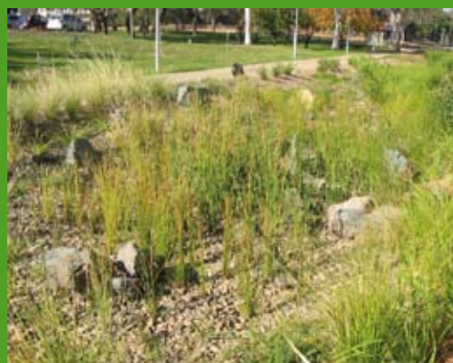
Above: This swale at the ANU provides an important dryland refuge, it has damp ground underneath rocks, logs and vegetation for most of the year, and provides temporary breeding habitat after rain.

The diagram below illustrates the main zones in which to locate the aquatic plants. The following section details plant species that are local to the Canberra region, for each of the zones of a frog friendly habitat.