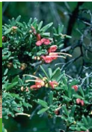
Grevillea lanigera