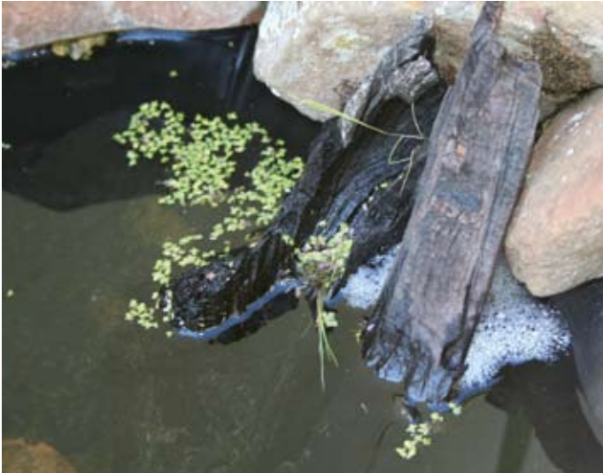
These logs provide a good access ramp for frogs.