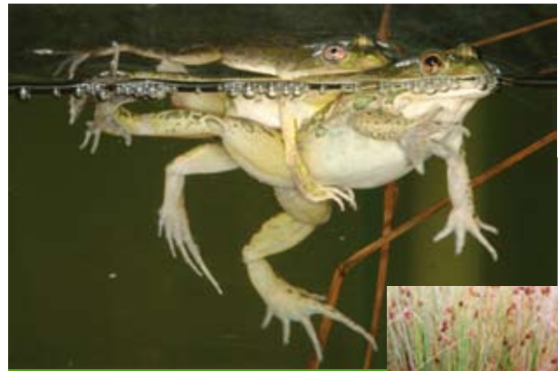
Two individuals (Limnodynastes tasmaniensis) in amplexus.

You will also need to consider that frogs can be extremely noisy during their breeding season. It is best to consult your neighbors about this issue before you begin, rather than having to fill in your pond or move it.