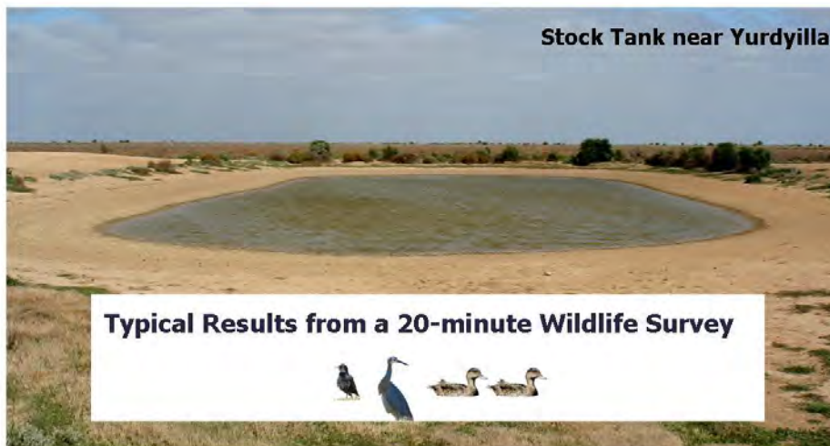
Stock Tank near Yurdyilla

Waterplants And Shallows Boost Wildlife Diversity In Farm Dams